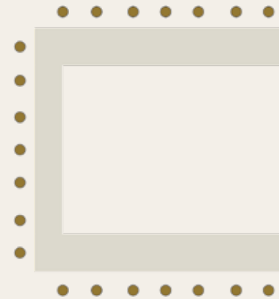
CONFERENCE SEATING Seating Capacity 24